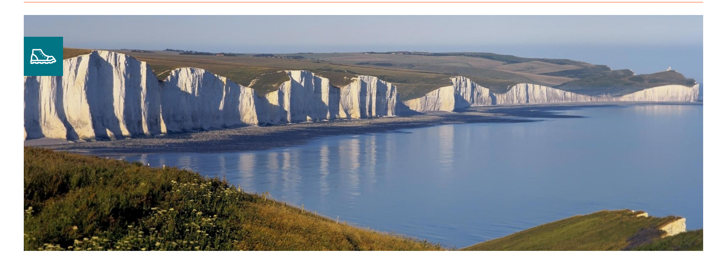
In aid of your choice of charity